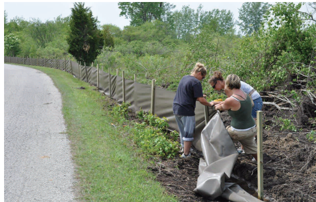
Installation of the wildlife fencing.